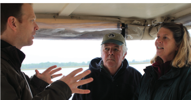
Maine Couple stops in for a tour at Fones Cliffs as part of thier journey along America's Great Loop.