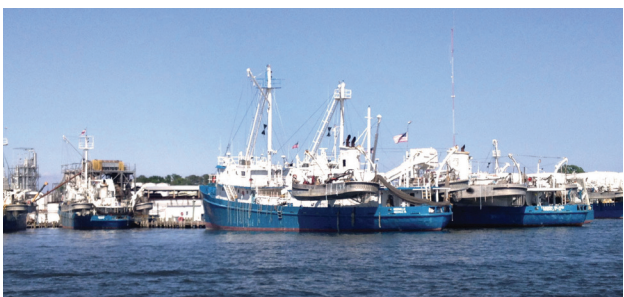
Boats gathered for the boat parade at last year's event

The Richmond County YMCA is currently still seeking leadership level gifts.