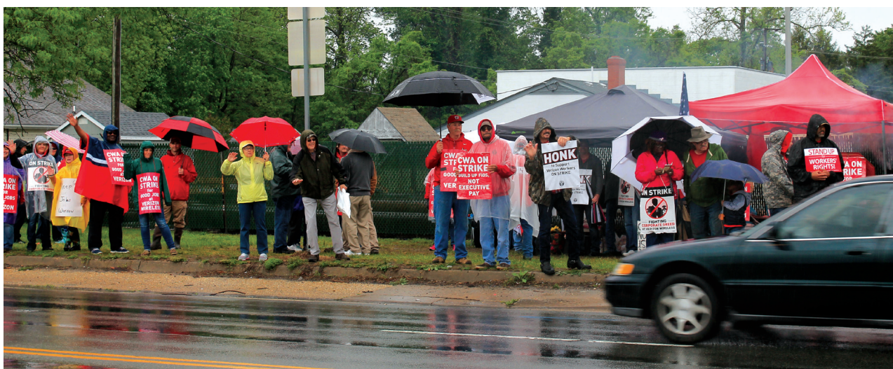
Verizon workers brave the rains and picket along Richmond Road in response to cancellation of their insurance by Verizon. This protest effort is one of many taking place across the state.